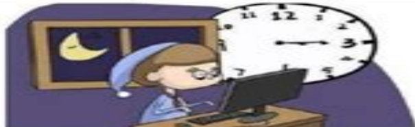
Staying up late.