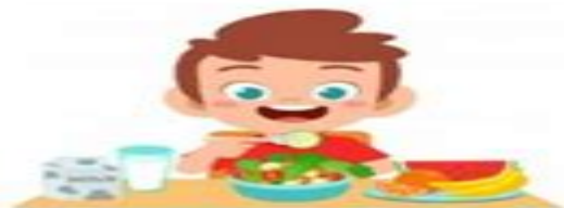
Eating a balanced meal.