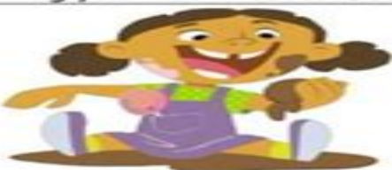
Playing in the dirt.