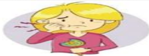
Eating too much candy.