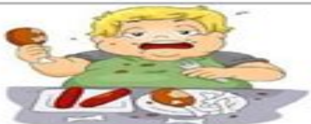
Only eating junk food.