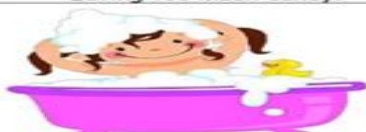
Taking a bath regularly.