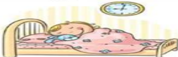
Going to sleep early.