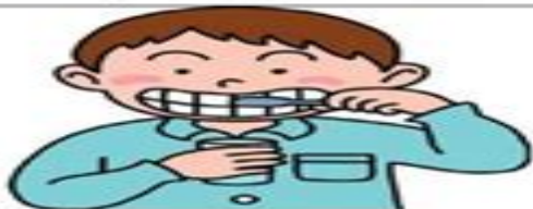
Brushing your teeth after meals.