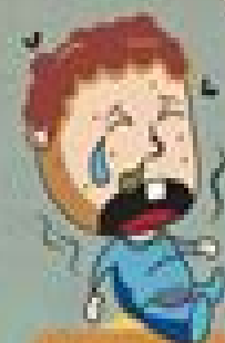
Negligencia o desatención