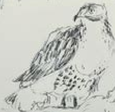
The hawk stayed by the Kill. Stopped to take pictures and she called out. This hawk later she was still there.