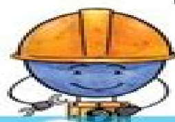
Dealing with Problems & Conflicts