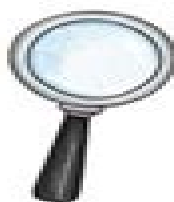
Identifying Social Cues