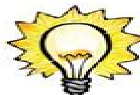
Expressing Ideas, Feelings & Thoughts