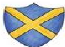
Using Coping Strategies