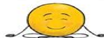
Staying Calm in Times of Stress