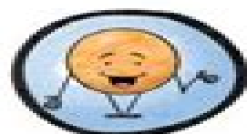
Understanding Personal Space