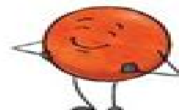
Having a Positive Attitude