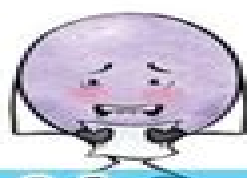
Dealing with Worries