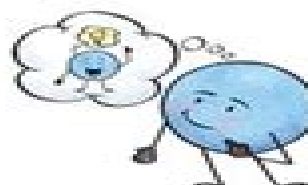
Thinking Before Speaking or Acting