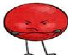
Dealing with Anger & Frustration