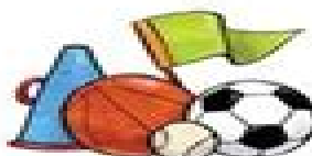
Being a Good Sport