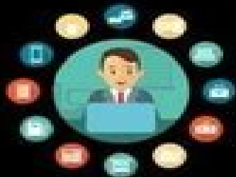
SKILLS AND HOBBIES