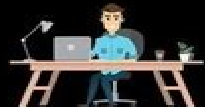
IMPLEMENTING WHAT YOU LEARN