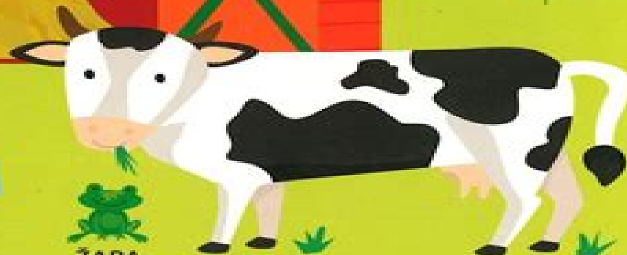
KRAVA THE COW (D' KAU) LA VACA (LA VACA)