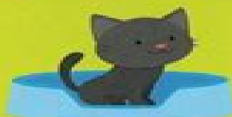
MAČKA THE CAT (D' KET) EL GATO (EL GATO)