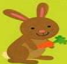
ZAJEC THE RABBIT (D' REBIT) EL CONEJO (EL KONEHO)