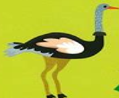
NOJ THE OSTRICH (D' ŌSTRİČ) EL AVESTRUZ (EL AVESTRUJUS)