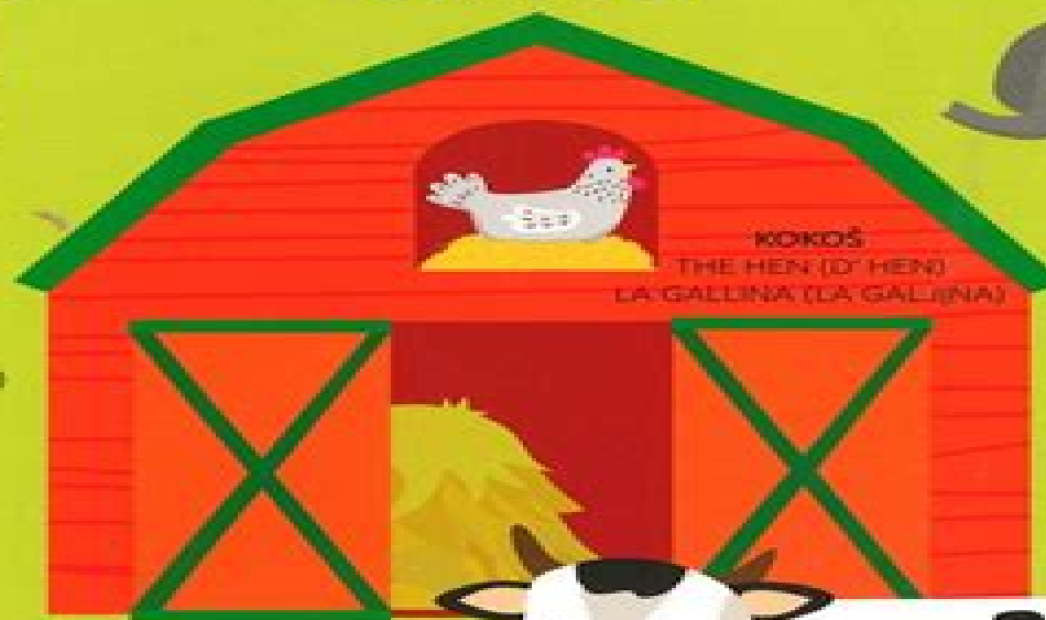
KOKOŠ THE HEN (D' HEN) LA GALLINA (LA GALLINA)