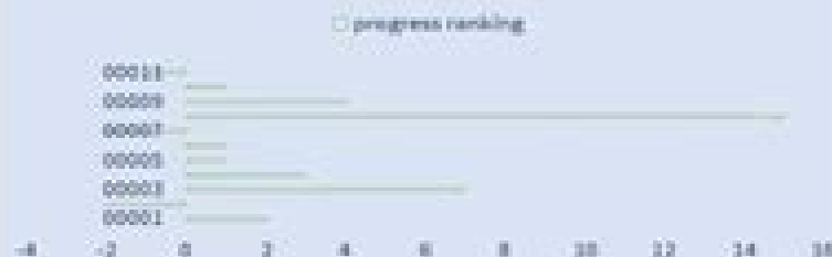
Analysis of students' progress in class examinations