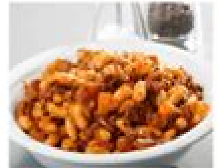
CHILI CON CARNE