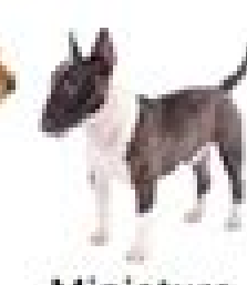
Miniature Bull Terrier