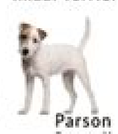
Parson Russell Terrier