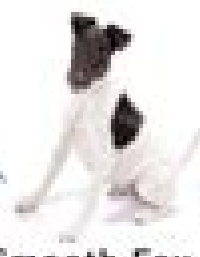
Smooth Fox Terrier