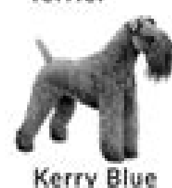
Kerry Blue Terrier