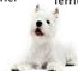
West Highland White Terrier