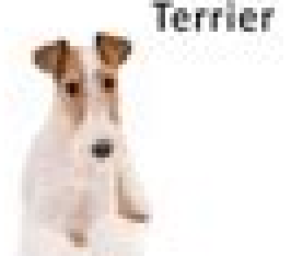
Wire Fox Terrier