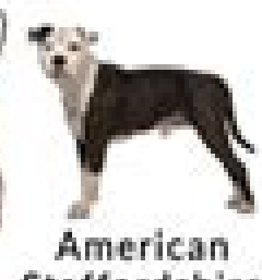
American Staffordshire Terrier