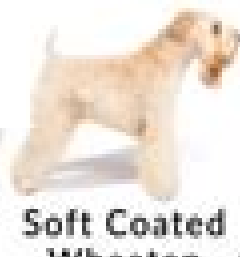
Soft Coated Wheaten Terrier