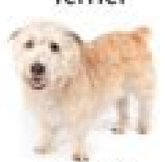
Glen of Imaal Terrier