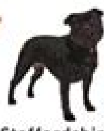
Staffordshire Bull Terrier