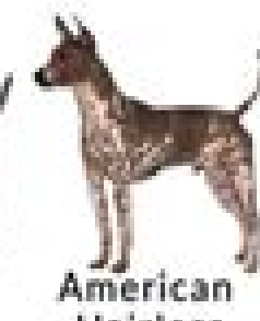
American Hairless Terrier