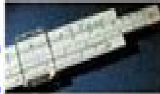
Slide rule - 1617 Mechanical calculator - 1642 Automatic loom (punched cards) - 1804