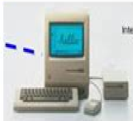
Integrated circuit - late 1950s UNIVAC - 1951 Microprocessor - 1971 Altair 8800 - 1975 Apple II - 1977 IBM PC - 1981 World Wide Web - 1990s