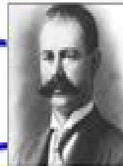
Hollerith's electric tabulator - 1890 Analog computer - 1927 EDVAC - 1946 ENIAC - 1947