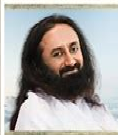
Sri Sri Ravi Shankar