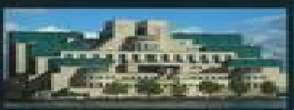
21ST CENTURY INTELLIGENCE