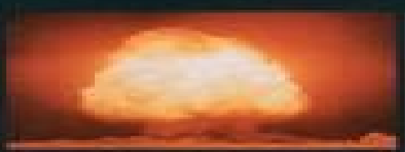
SCIENCE, THREATS & TRAITORS