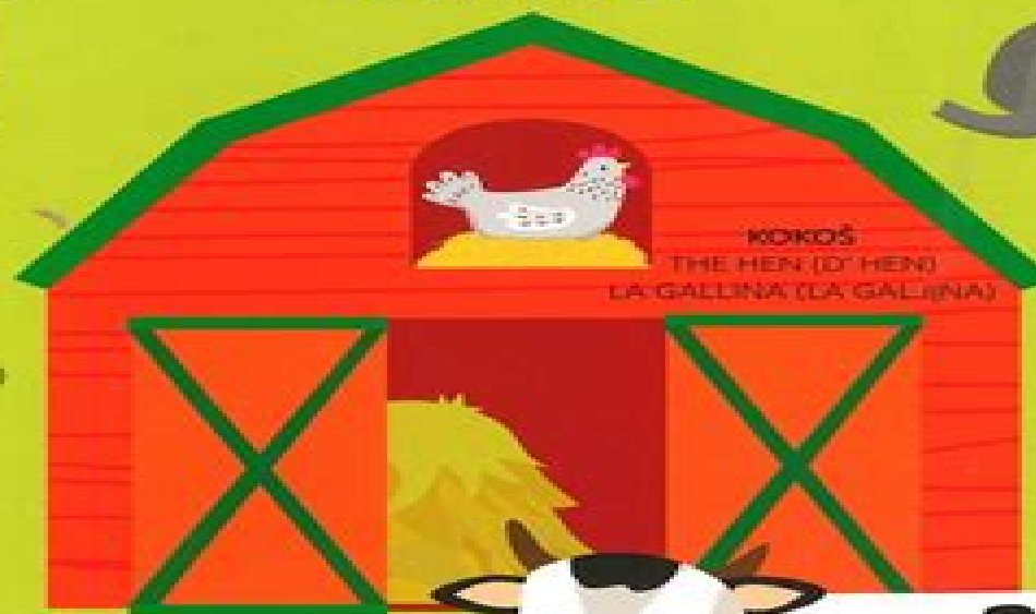
KOKOŠ THE HEN (D' HEN) LA GALLINA (LA GALI(NA))