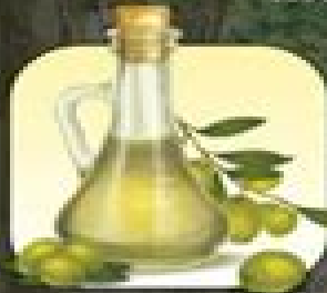
Olives & Olive Oil

The Bible identifies many foods that are beneficial to good health and longevity. This is important because your diet can have a profound impact on your physical, mental, emotional and spiritual well being.