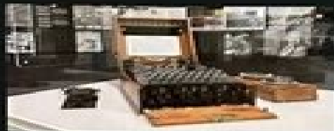
BREAKING THE CODES