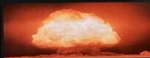
SCIENCE, THREATS & TRAITORS