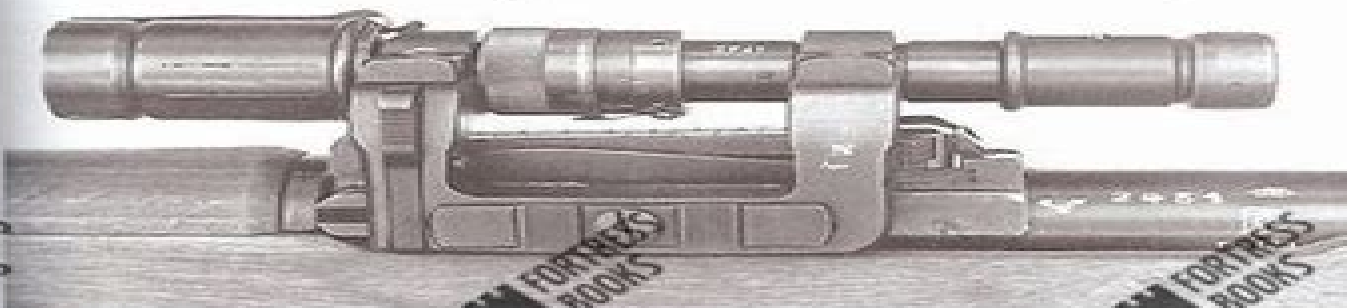
Abb. 1.26 Mauser: Karabiner und weitere Seitenansicht, Ansicht von oben. Der Karabiner trägt das Gewehr -ergo- Mauser-Maßgewehr-Indikator. Die Schüttschraube ist mit einem Kollisionsfeld versehen und ist mit einem Kollisionsfeld versehen. [16]