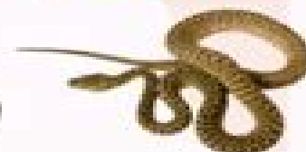
Torresian Carpet Python