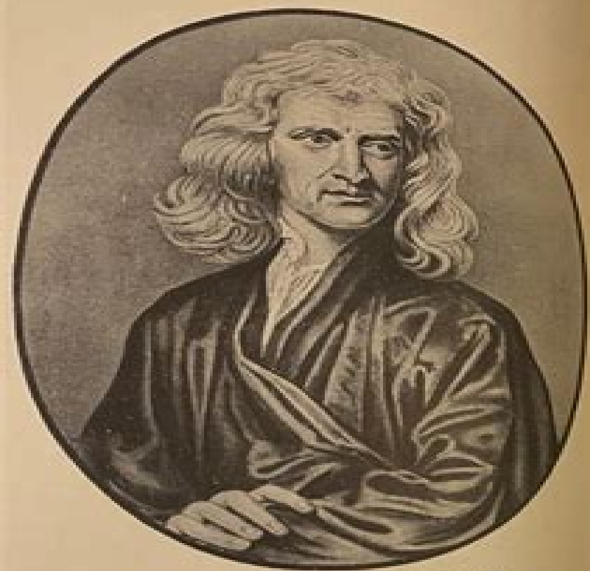
SIR ISAAC NEWTON