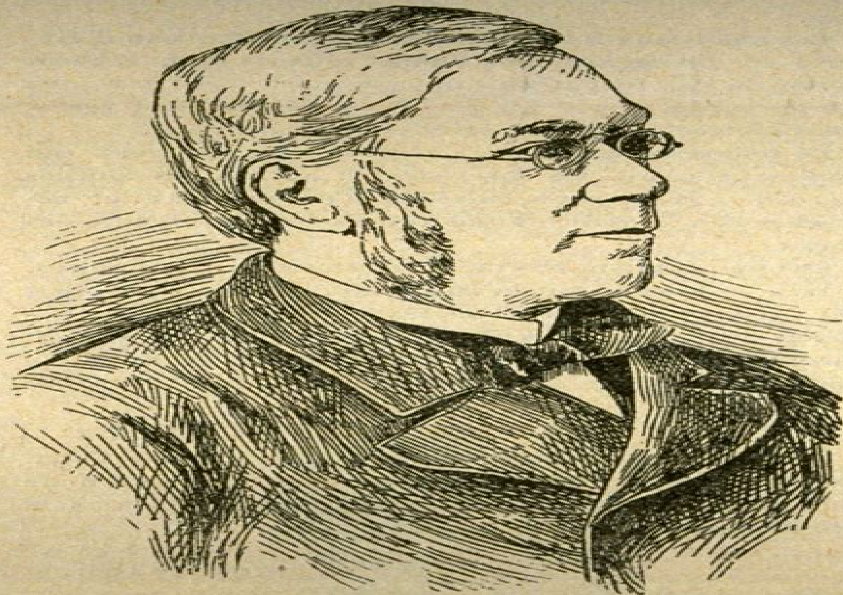
SIR OLIVIER MOWAT Lieutenant-Gouverneur d'Ontario