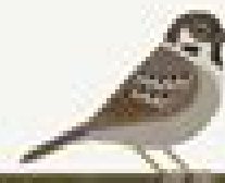
Feldsperling Spasser montanus