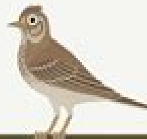
Feldlerche Alauda arvensis