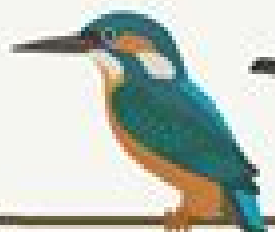
Eisvogel Alcedo atthis