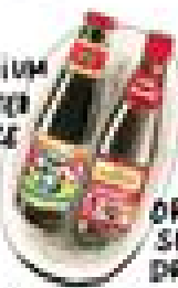
PREMIUM OYSTER SAUCE