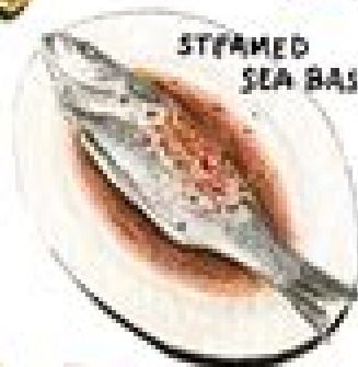
STEAMED SEA BASS