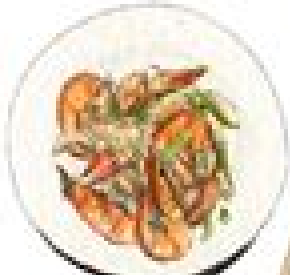
CHIU CHOW CHILI PRAWNS