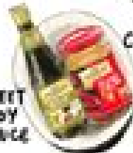
SWEET SOY SAUCE