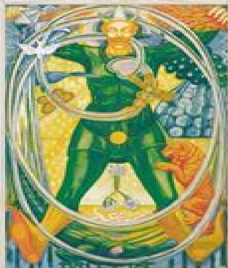
18 The Fool 19