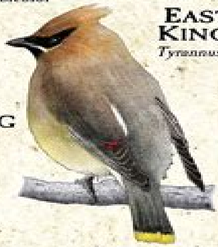
CEDAR WAXWING Bombycilla cedrorum