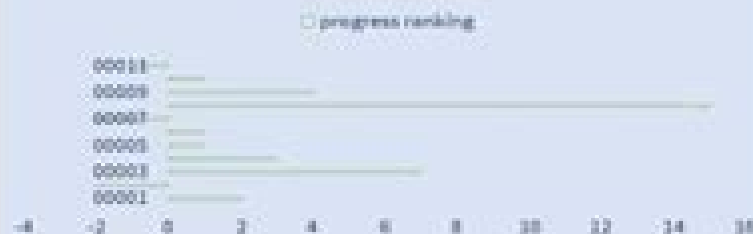
Analysis of students' progress in class examinations