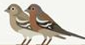
Buchfink Fringilla coelebs