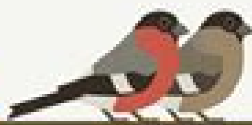
Gimpel Fringilla pyrrhula