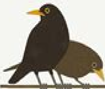
Amsel Turdus merula