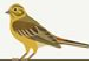
Goldammer Emberiza citrinella