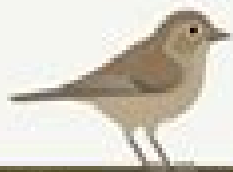
Gartengrasmücke Sylvia borin