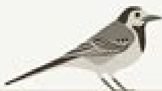
Bachstelze Motacilla alba