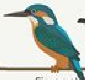
Eisvogel Alcedo atthis