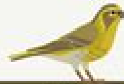
Girrlitz Carduelis arvensis