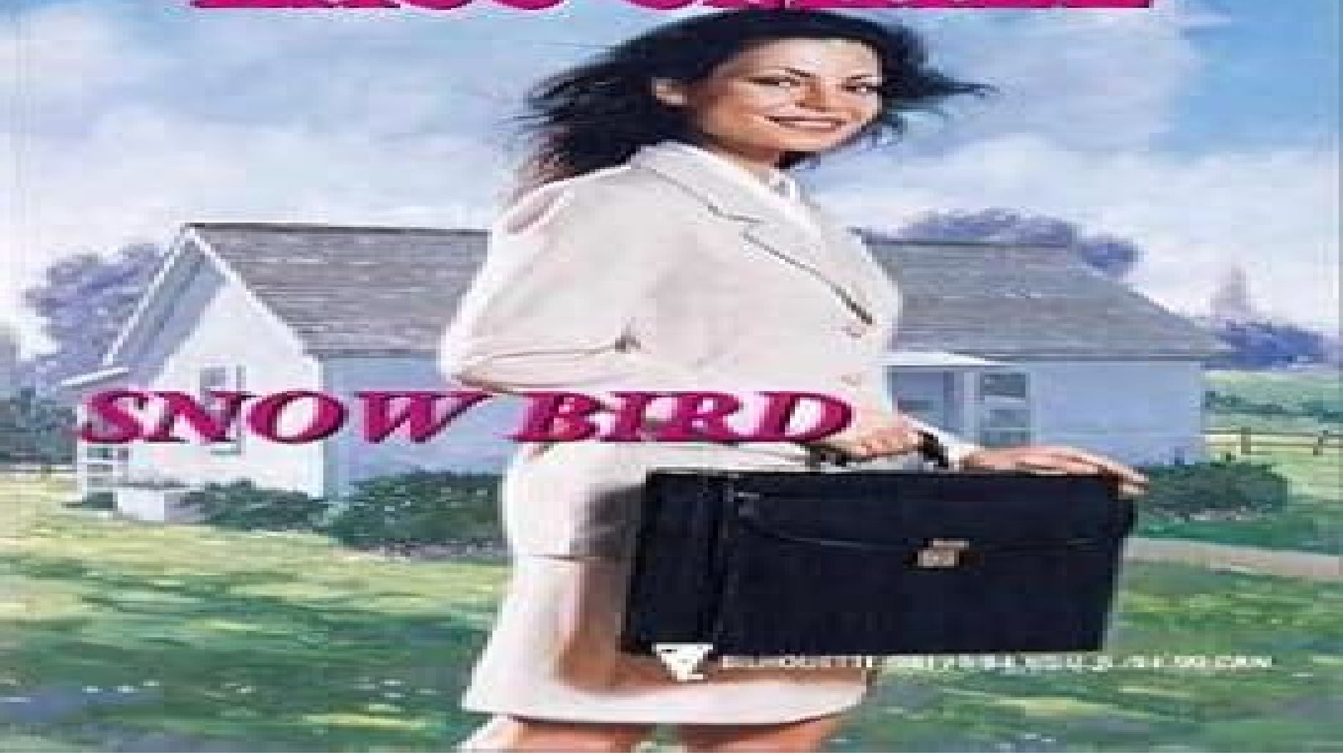
ILLUSTRATION BY JANE BROWN