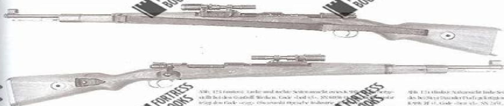
Abb. 1.25 Mauser: Karbin und weitere Seitenansicht, Ansicht von oben. Der Gewehr 98 hat eine Gesamtlänge von 1,25 m, eine Lauflänge von 0,75 m, eine Gewicht von 10,5 kg. Die Gewehr 98 hat eine Gesamtlänge von 1,25 m, eine Lauflänge von 0,75 m, eine Gewicht von 10,5 kg. Die Gewehr 98 hat eine Gesamtlänge von 1,25 m, eine Lauflänge von 0,75 m, eine Gewicht von 10,5 kg.