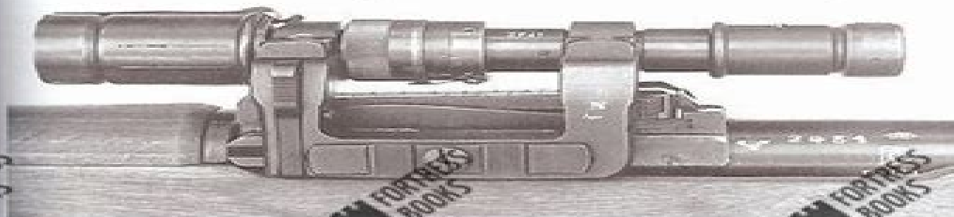
Abb. 1.26 Mauser: Teleskopische Vorderansicht des Gewehr 98 mit dem Teleskopsicht. Die Gewehr 98 hat eine Gesamtlänge von 1,25 m, eine Lauflänge von 0,75 m, eine Gewicht von 10,5 kg. Die Gewehr 98 hat eine Gesamtlänge von 1,25 m, eine Lauflänge von 0,75 m, eine Gewicht von 10,5 kg.