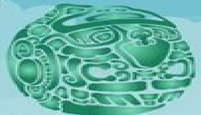
KINICH AHAU Mayan