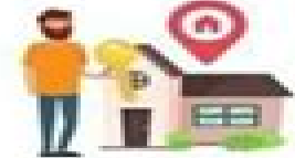
Real Estate Investing