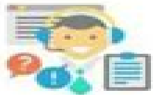
Sales & Marketing