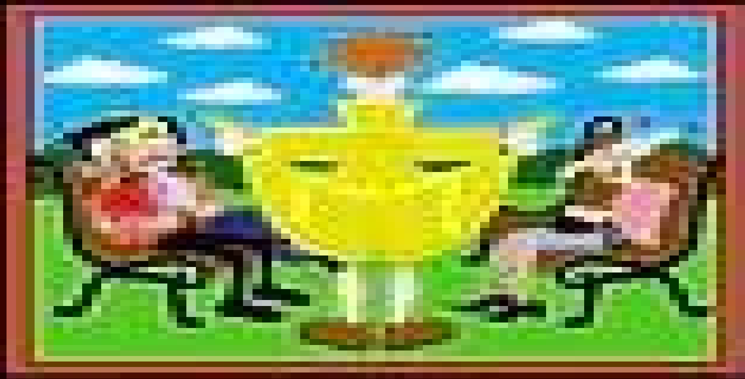
ILLUSTRATION BY JIMMY K. SPENCER

— A GUIDE TO THE LANGUAGE OF AMERICAN AND BRITISH TV —