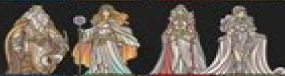
DAHBROGO | BABA | ZORYA | LADA