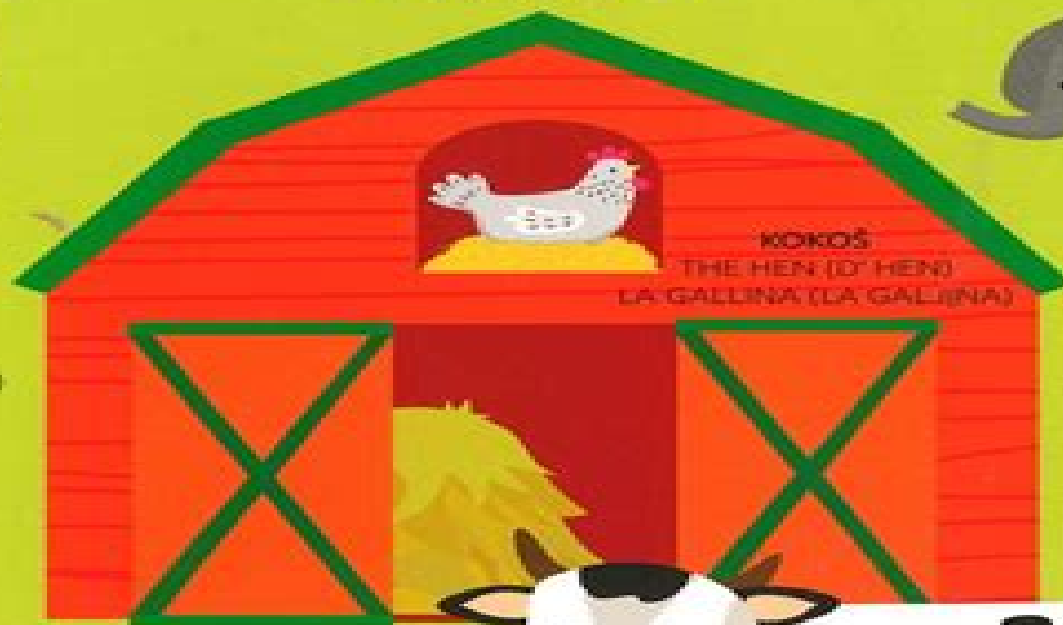
KOKOŠ THE HEN (D' HEN) LA GALLINA (LA GALLINA)