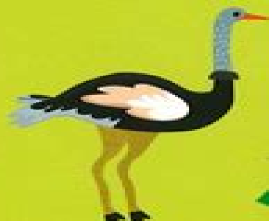
NOJ THE OSTRICH (DI OSTRIC) EL AVESTRUZ (EL AVESTRUS)