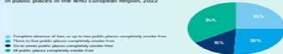
Fig. 1. Percentages of countries with bans on smoking in public places in the WHO European Region, 2022