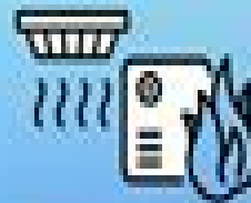
Smoke & Carbon Monoxide Detectors