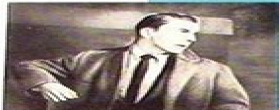
BIG SHOT IN A BIG SQUEEZE

Here come the people raging... the passions blazing out of the decade's wrathful best-seller!