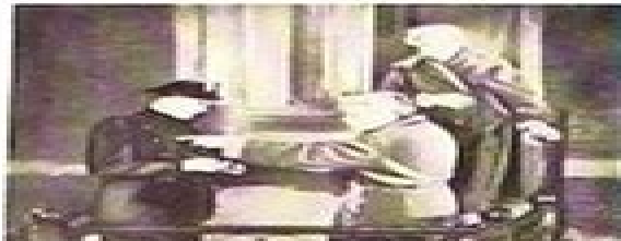
THE FIGHTING-MAD DOCTOR