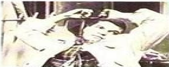
THE HOOD IN THE HEADLINES