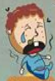
Negligencia o desatención