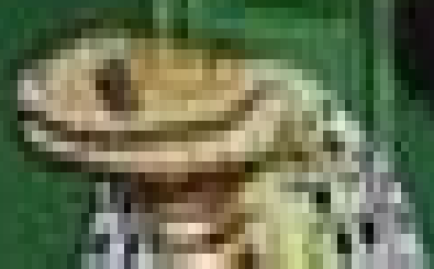
Illustration by [unreadable]