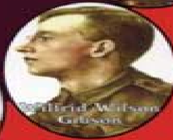
Wilfred Wilson Gibson