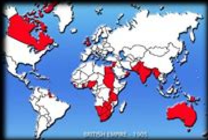
Population: overseas (millions)