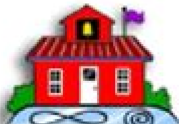
SCHOOLS & TRAINING