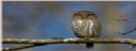
Northern Pygmy Owl