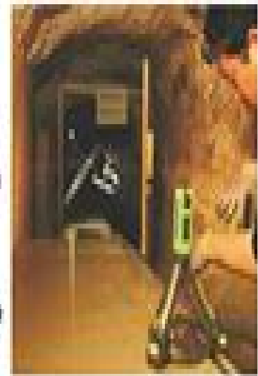
Detectors being set up in Queen's Chamber

The technology measured muons, a by-product of cosmic rays from stars exploding in the universe and raining down to earth at nearly the speed of light. More muons pass through voids than through stone, as stone absorbs them. Detectors were placed in the Queen's chamber, the descending passageway and outside the pyramid near its north face.