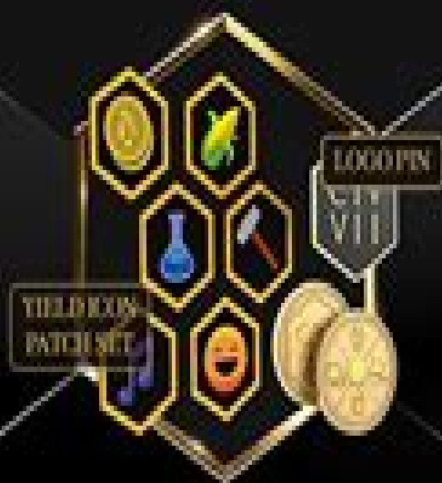
THE BOX PATCH SET