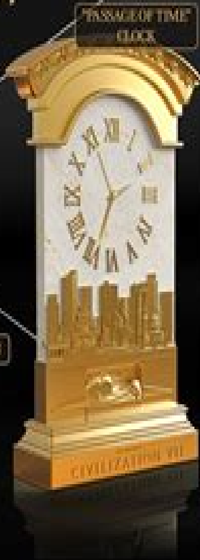
"PASSAGE OF TIME" CLOCK