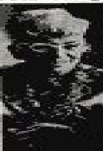
Little Old Lady From Dubuque

Little Old Lady From Dubuque Seeks to Change Town's Image