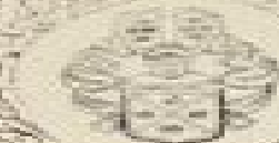
HOUSE OF ANDREW

REPRINTED BY THE PACIFIC METHODIST PUBLISHING HOUSE OF RELIGION