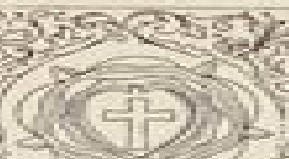
HOUSE OF ELIXIOR