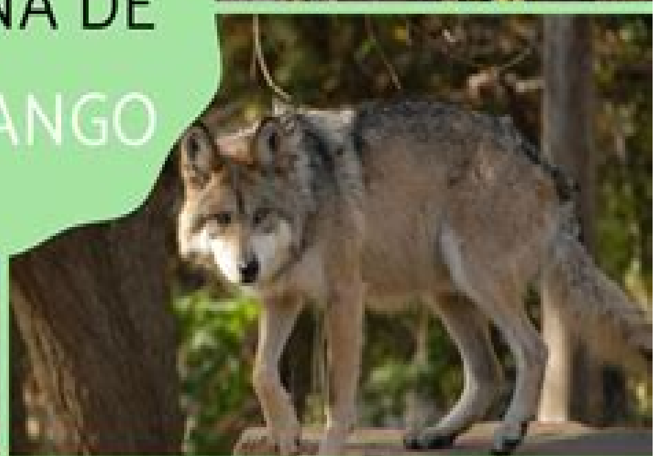
LOBO GRIS MEXICANO