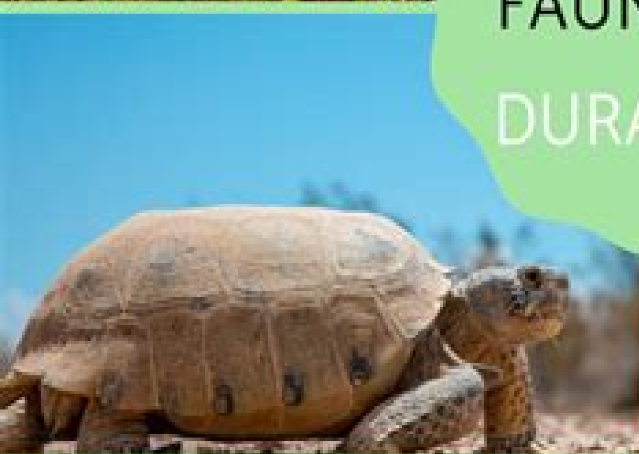
TORTUGA DEL BOLSÓN