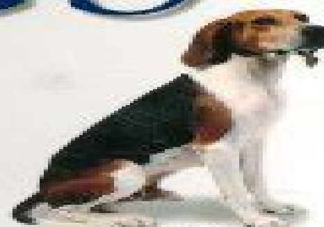
Treeing Walker Coonhound