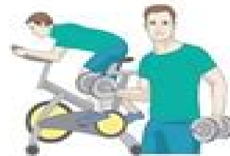
Consistent Exercise Weights + Cardio