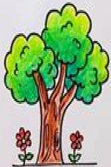
Trees and Flowers