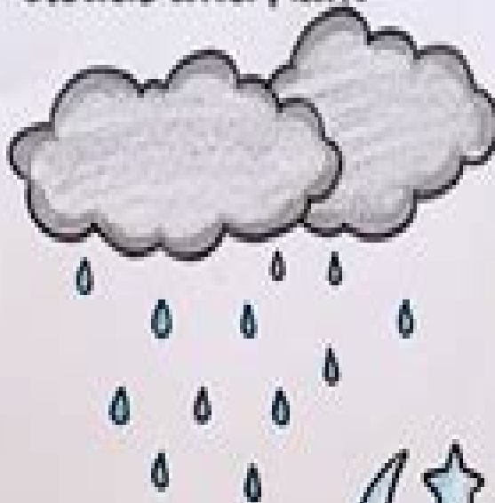
Clouds and Rain