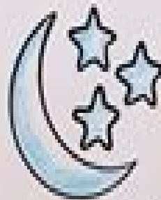
Moon and Stars