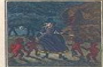
Mother Goose, passing the Egg into the Jail.